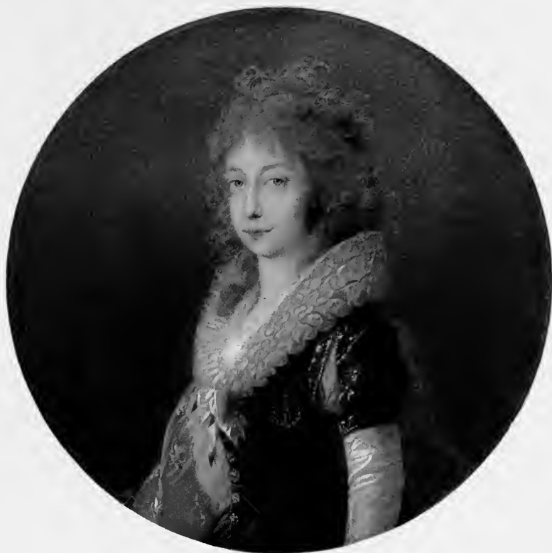
EMPERESS MARIA THERESIA, SECOND WIFE OF THE EMPEROR FRANCIS I OF AUSTRIA BY HEINRICH FRIEDRICH FÜGER

1800 1801 1802 1803 1804 1805 1806 1807 1808 1809 1810 1811 1812 1813 1814 1815 1816 1817 1818 1819 1820 1821 1822 1823 1824 1825 1826 1827 1828 1829 1830 1831 1832 1833 1834 1835 1836 1837 1838 1839 1840 1841 1842 1843 1844 1845 1846 1847 1848 1849 1850 1851 1852 1853 1854 1855 1856 1857 1858 1859 1860 1861 1862 1863 1864 1865 1866 1867 1868 1869 1870 1871 1872 1873 1874 1875 1876 1877 1878 1879 1880 1881 1882 1883 1884 1885 1886 1887 1888 1889 1890 1891 1892 1893 1894 1895 1896 1897 1898 1899